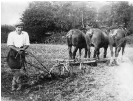
photo was taken in 1927 at the 1st Cruckton Ploughing Match.

The prizes for 1st, 2nd & 3rd was £5, £3 and £2, amazing really because wages at that time were the equivalent of £1.50 for a 56 hour week! This